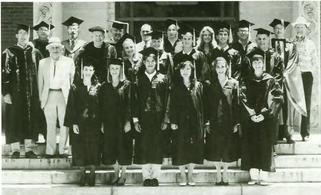
Graduating class of 1994