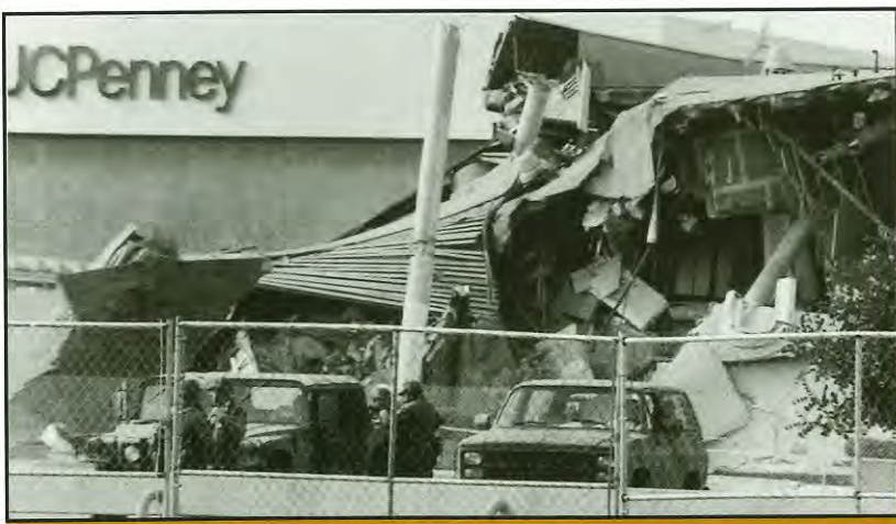
The Northridge Bullocks remains from the January 17, 1994 Earthquake